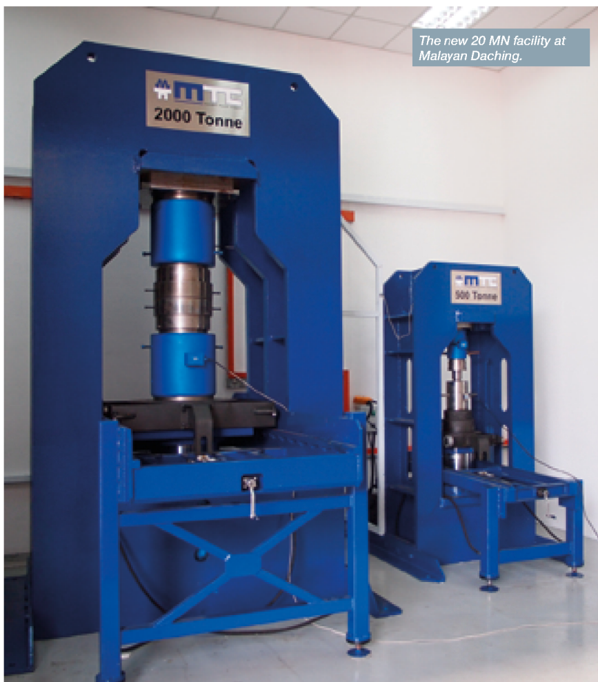
The new 20 MN facility at Malayan Daching.

"If they are ok with our scope then we will probably go into a little bit more detail on what kind of indicator do they have, because if you have a load cell, the load cell will signal to an indicator. We need to understand how we can work with this indicator, and then if everything is fine and the engineers are happy then the job will be done," he added.