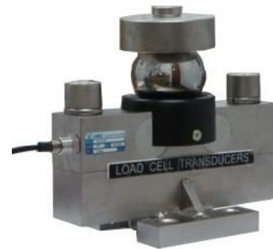
Capacity: 10T, 25T, 30T